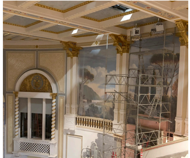
Audience chamber interior

Underground utilities, including water and gas, were completed this summer, making way for the layout and preparation of new sidewalks on North Tryon Street and 6th Street.