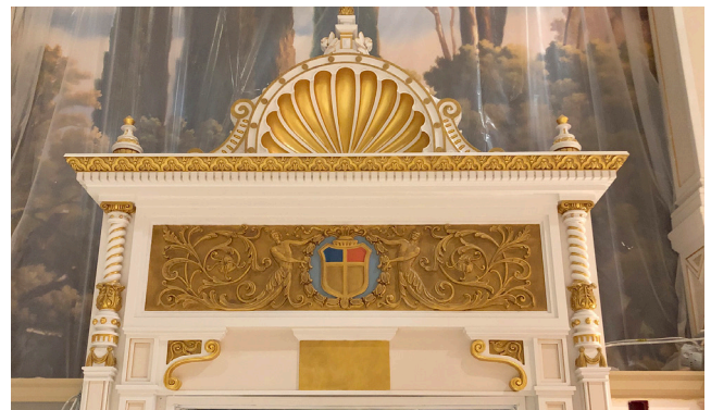
Decorative plaster work on balcony level and restored mural panel