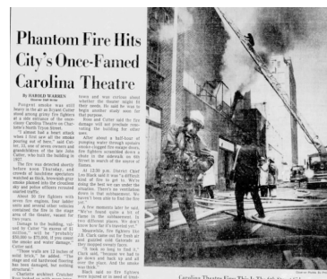
Carolina Theatre Fire: Thick Smoke Fills Stage

The newly renovated theatre will feature a state of the art fire detection system complete with sprinklers and a new fire curtain.