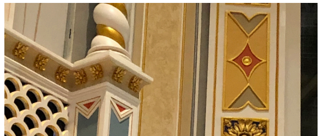
Detail of the organ loft and proscenium