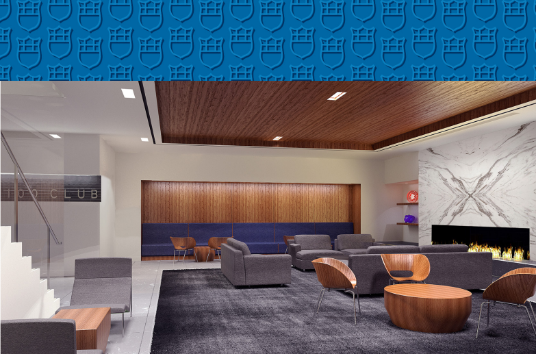
Conceptual image of The 100 Club as conceived by DLR Architects